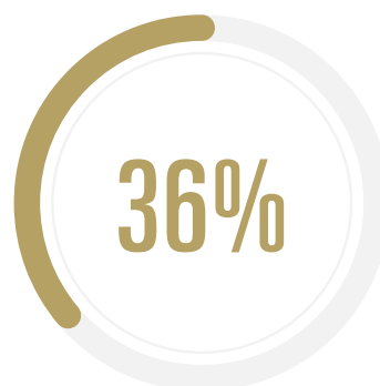
2020 NEW MEMBERS ARE FROM UNDERREPRESENTED ETHNIC/RACIAL COMMUNITIES IN THE ORGANIZATION